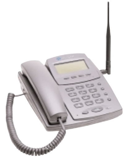
Phonocell SX5D GSM Fixed Wireless LCR Phone